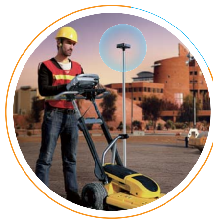
Sensor equipment Integrated as a sensor