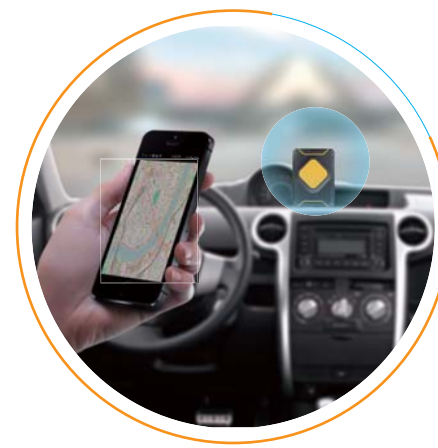
Vehicle Navigation application