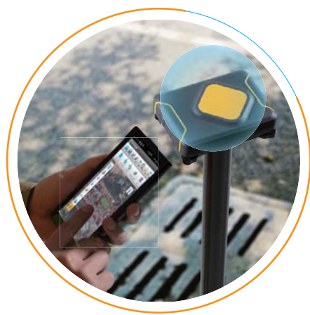
Mobile Phone Professional surveying pole